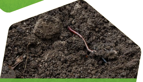
Soil improvement through oilseed rape cultivation

15 % more yield at 1 application in autumn plus 2 applications in spring.